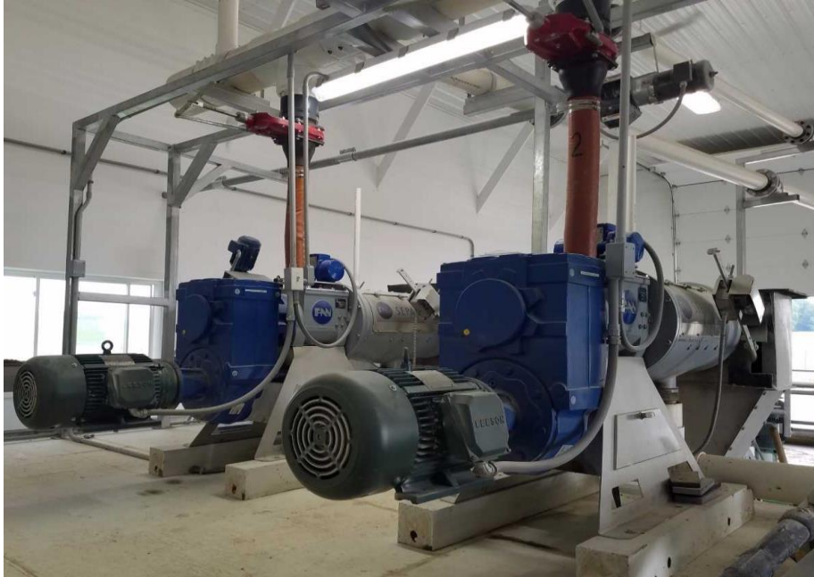
Figure 2. Two parallel FAN screw-press solid liquid separators (SLS)