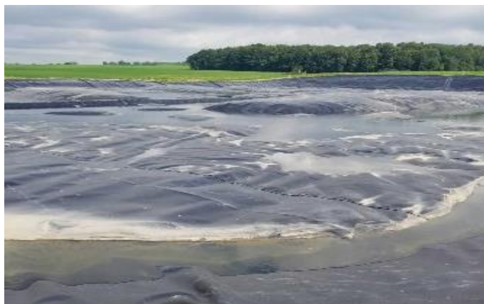
Table Rock Farm's manure storage cover