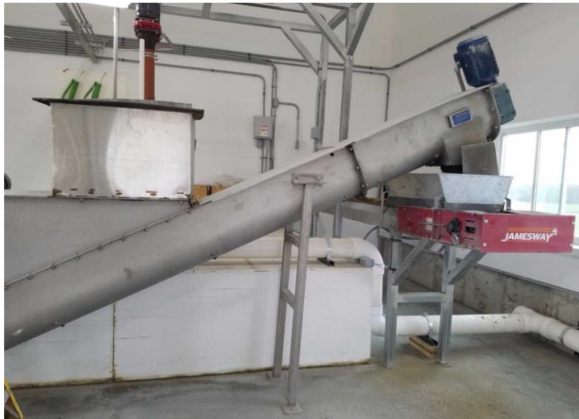
Figure 3. Inclined, conveying lime auger system to automate the lime addition process.